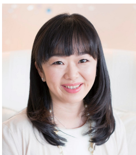
Director Poppins Corporation, Japan