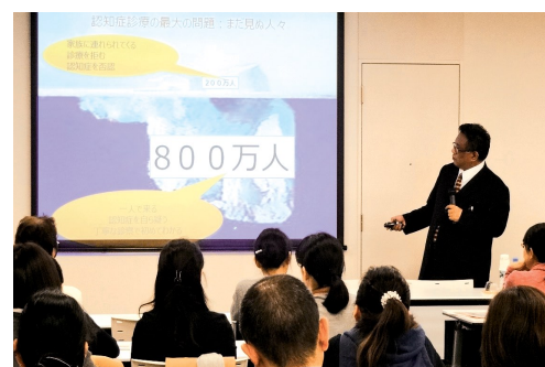
Many regional experts also attended