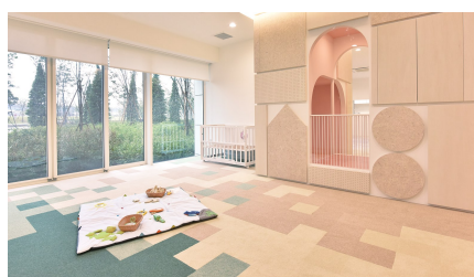
Poppins Nursery School Harumi Bun'en

Poppins now runs 162 facilities throughout Japan and Hawaii, U.S.A.