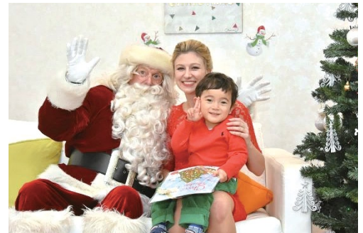
The gift of reading from Santa Claus

At Poppins Active Learning International School (PALIS) located in the beautiful Yebisu Garden Place complex, we offer seasonal “Be Our Guest” Programmes that even first-time English speakers can join. In the latest winter Programme, children completed fun and exciting activities ranging from making Gingerbread Houses, to performing Nutcracker Puppet plays. These activities allowed the children to use all five senses and learn some English. At the Christmas Party, to which parents were also invited, we were visited by Santa Claus! He added even more joy and laughter by singing with the children and handing out gifts. For further information, please visit the official website: www.poppins-palis.jp/ Find programme information on our website: www.poppins-palis.jp/ [Inquiries] 03-5791-2105 or palis@poppins.co.jp