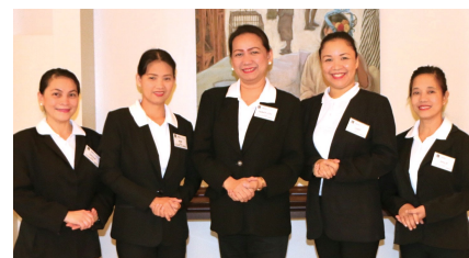
Poppins' Filipino housekeeping staff are all graduates or qualified nurses

[Inquiries] 03-3447-6131 or kaji@poppins.co.jp