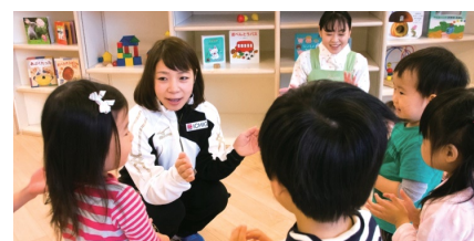
Olympian Hiromi Miyake reads a picture book out loud to children for the first time in her life