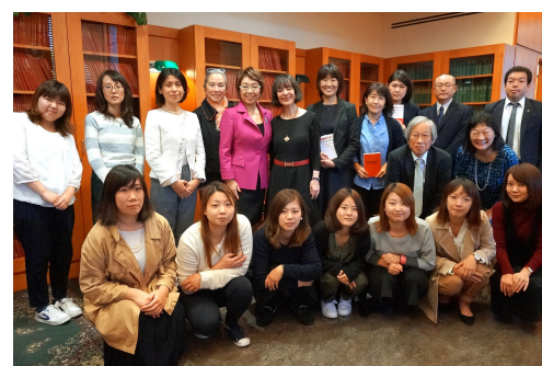
With Professor Carol S. Dweck at Stanford University