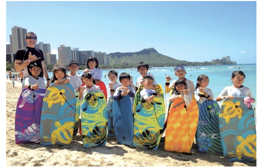
Learn to bodyboard on Waikiki beach

At Poppins Keiki Hawaii, every child can start each day by meeting children from all over the world at the Sheraton Waikiki. In our indoor Holiday Programme children can enjoy making ocean themed jewelry, and learn about Hawaiian culture (including Hula or Ukulele lessons). Outdoor activities including cruises are also available. If you are lucky, sea turtle families might stop and even say hello! Our Golden Week Programme will be available from 29th April until 7th May. For more details about the Poppins Keiki Hawaii Programme, visit our Facebook page: www.facebook.com/poppinshi For reservations: www.poppins.co.jp/hawaii/contact_reservation/