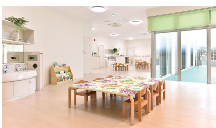
Poppins Nursery School Magome