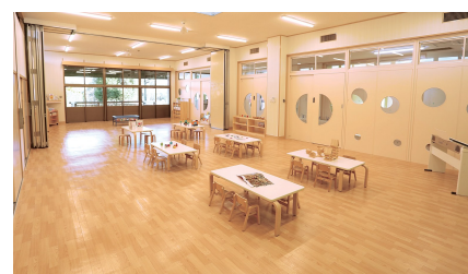
Ton Ton Kids Koga