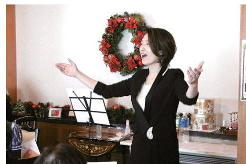
Music and entertainment by a former Tarazuka Revue performer