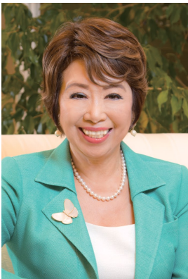
President and CEO Poppins Corporation, Japan