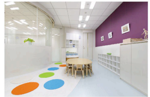
Poppins Nursery School Marunouchi