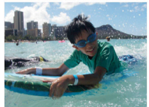
Enjoying the beach