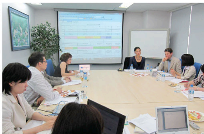
At Poppins Head Quarters