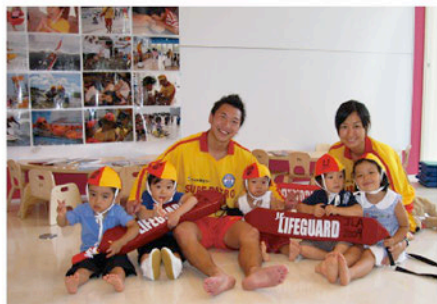
The special Life Saving Programme

With a total capacity of 50 students, Poppins Active Learning School provides 4 classes based on age: Infant (0 – 8 months), Toddler (9 – 24 months), Preschool Junior (25 – 36 months), and Preschool Senior (over 36 months). Each class is led by a Mentor, responsible for documentation of each child's learning, and assistant teachers. In addition, all programmes are led by experts in their respective fields.