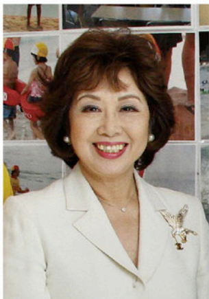
Founder / President Poppins Corporation, Japan