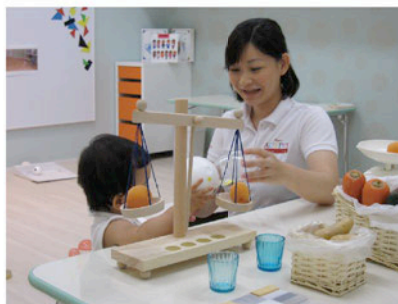
The Maths Programme