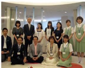
The Prime Minister with Mrs Nakamura and Kuukids staff

Prime Minister Naoto Kan visited ALBION's (ALBION Co., Ltd.) on site nursery school, Kuukids operated by Poppins in July to see the support given to employees with young children; supporting child-raising is one of the new Government's 5 pledges.