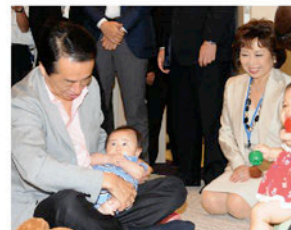
The Prime Minister with a baby