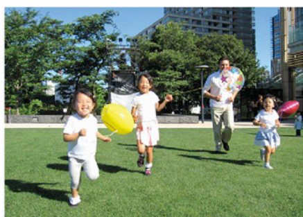
Children in the Midtown garden with the Vice Principal

A main feature of the curriculum is the Kid's Life Saving programme developed by Poppins and the NPO Japan Life Saving Association especially for this school. The programme teaches young children a respect for life and the skills necessary to protect themselves, and others around them, from accident and injury. The curriculum also includes Active Music, Active Art and Sensory Experiences, Active Japanese Language and Active Maths.