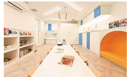
Poppins Nursery School Etchujima