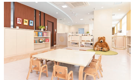
Poppins Nursery School Toritsu-Daigaku