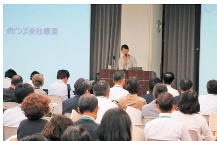
Finding an eager audience among current and future carers alike

The number of people who currently work while caring for family members is said to be 3.5 million, accounting for around 10 percent of all company employees. On top of this, each year some 100,000 individuals leave their jobs to care for family members. Based on 22 years of in-home nursing care experience, Poppins Silver Care Services has begun dispatching consultants to assist companies with relevant seminars and individual consultations aimed at preventing the loss of workers due to such reasons. Experienced, nationally qualified consultants provide support for combining care and careers by covering all aspects of nursing care, including work-care balance, insurance systems, dementia and terminal care.