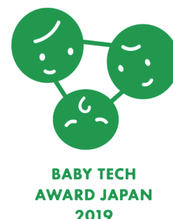
Commended for high quality