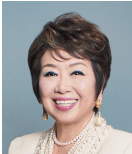
Chairperson Poppins Holdings Inc.