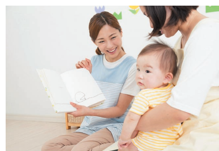
Childcare/educational facilities expand to 306 locations nationwide

On 29 March, childcare and parenting support services provider Temp Staff Wish became a member of the Poppins Group under a new company name, Wish Corporation. This brought the number of Poppins Group-operated childcare/educational facilities to 306 nationwide as of 1 April 2019, along with 5 facilities for the elderly. With the addition of Wish, the Poppins Group seeks to further improve childcare quality by leveraging the strengths of both companies. Through our operation of nursery schools and babysitting services, we continue to build the foundations that allow us to make greater contributions to the challenge of increasing childcare availability.