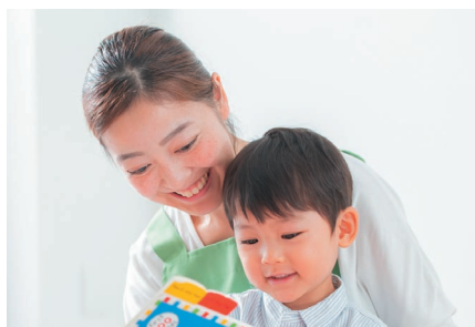
Homework or piano instruction also available

Together with Showa Women's University, in June we launched the 'University Student Babysitter' internship system, which provides opportunities to learn about balancing parenting and work in real-world environments. The system enables registered university student sitters who possess Level 4 Nanny certification, the Smart Sitter screening standard, to offer their services for elementary school-aged children. Smart Sitter concludes separate agreements with both users and participating students, and is responsible for handling any problems that may arise. We are striving to expand internship programs in the childcare industry and offer a greater range of new services to customers through Smart Sitter.