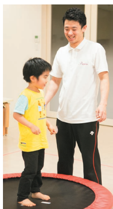
Trampoline instruction at the nursery school