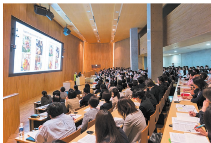
A full house at the symposium venue