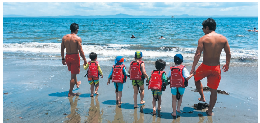
Lifesaving classes on the Miura coast are another returning favorite!