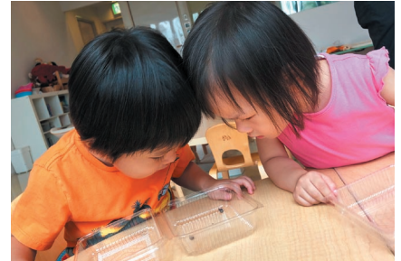
Children earnestly observe pill bugs