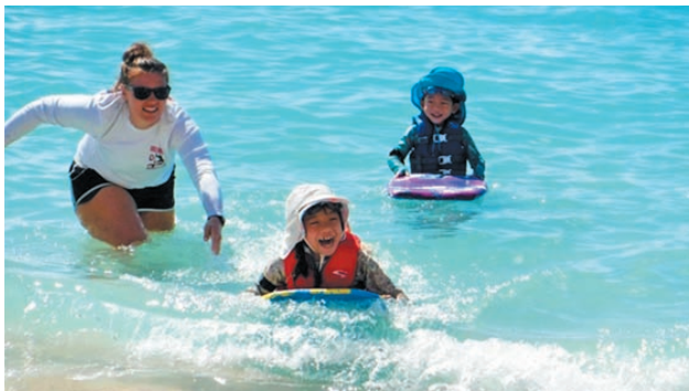
Bodyboarding on the waves

[Reservations] www.poppins.co.jp/hawaii/contact_reservation/