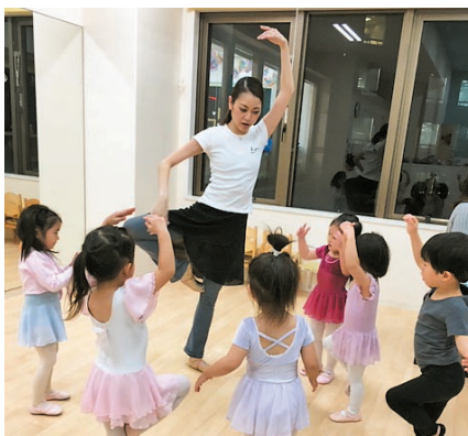
Last year's popular K-Ballet classes are back again!

[Inquiries] 03-5791-2105 or palis@poppins.co.jp