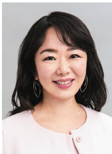
President Poppins Corporation