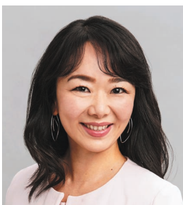
President, Representative Director Poppins Holdings Inc.