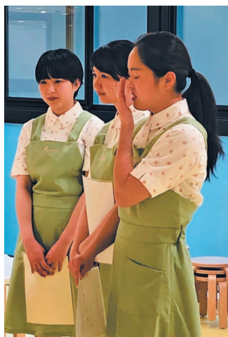
New staff receive a surprise on their first day of work

For the 2020 school year, Poppins welcomed 138 new graduates who joined our team as nursery school teachers and nutritionists. Their first day of work included a surprise, as our new recruits received letters of encouragement from their parents. With the welcoming ceremony postponed due to the impact of COVID-19, as a company we wanted to do what we could to support the new staff who will sustain the front lines of childcare. There were scenes full of surprise and emotional tears as facility directors read each letter before handing them to the new members of staff. A month later, as these new graduates were beginning to experience life as working adults, they had the opportunity to respond by surprising their parents with letters of gratitude, conveying their appreciation in writing and sending thanks for the constant gift of warm support.