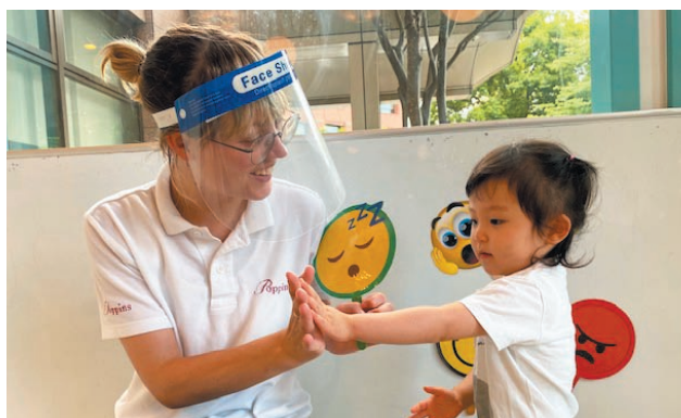
Face shields are used for circle time

[Inquiries] 03-5791-2105 or palis@poppins.co.jp