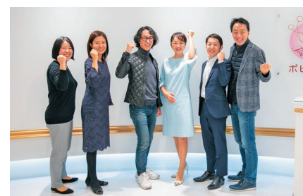
The DX Division team

In January, Poppins established a Digital Transformation (DX) Division, which is responsible for online projects such as online childcare, as well as launching and reforming projects through the latest digital technologies, including AI and IoT. To set up the division, we enlisted the assistance of consultants who had previously served as top managers at IBM and Yahoo, and also recruited digital talent from outside the company. We will continue to take on new challenges and pursue industry-first innovations that enable us to offer more attractive and convenient services to our customers.