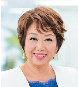
Chairperson, Representative Director Poppins Holdings Inc.