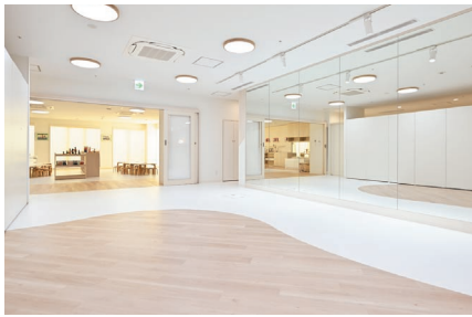
Poppins Nursery School Myoden