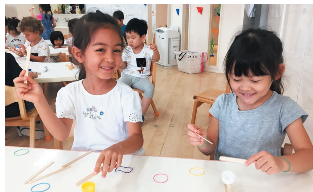
Lots of fun crafts to inspire creativity!