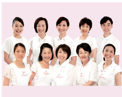
Poppins Super Nannies

To address parent concerns about childcare, we have developed a new service that offers online support by Super Nannies, the finest nannies at Poppins. Some parents don’t have anyone nearby to turn to with their childrearing concerns, perhaps as a result of Japan’s increasing trend towards nuclear families, or because they are the sole parent responsible for raising children. For these parents, our ‘Super Nannies’ – professional sitters with a wealth of experience caring for many children – offer advice on various aspects of childcare, ranging from prenatal and postnatal counseling to toilet training, exam preparation, and even suggestions for indoor play. The service is provided online, catering to parents both in Japan and overseas. More details can be found at https://coubic.com/poppins-online