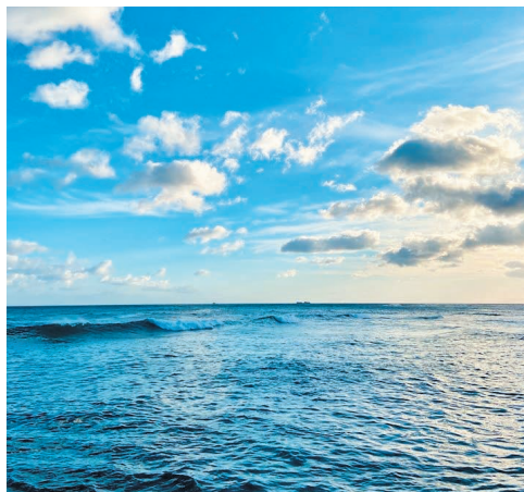
The water on Waikiki Beach is clearer than ever!

Poppins Keiki Hawaii offers the only licensed kids' rooms operated by a Japanese company in the state of Hawaii. As of late July, the Sheraton Waikiki Hotel that hosts Poppins Keiki Hawaii is undergoing renovations; as such, the facility is currently not operating. In preparation for welcoming children through its doors once again, Poppins Keiki Hawaii has drawn up a health policy that prioritizes safety and security in accordance with Department of Human Services (DHS) guidelines. Our entire staff is working hard to make preparations, including stocking sanitary goods and conducting safety training, to ensure that both children and parents enjoy a special, worry-free time in Hawaii. We eagerly await the day when we can be reunited with all those smiling faces.