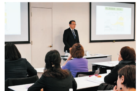
The venue was filled with medical welfare professionals and the families of patients