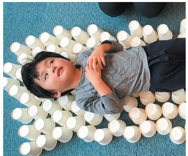
Learning about 'force distribution' by lying on top of many paper cups

[Inquiries] 03-5785-2131 or activelearning@poppins.co.jp