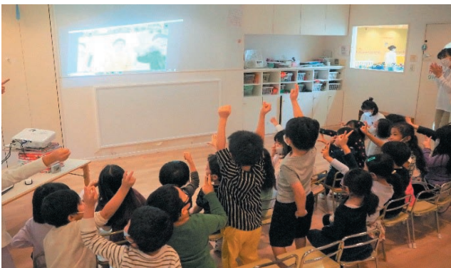
The virtual rock-paper-scissors competition was a big hit

Regrettably, the impact of the coronavirus last year forced us to cancel our regular hands-on events, including rice planting and harvesting. Instead, we organized online events to ensure that the children could enjoy themselves despite the circumstances. In place of the rice harvest, we shared a food education program with quizzes and experiments on the topic of where rice comes from. For Halloween, the children had a lot of fun with dancing and lessons by bilingual teachers. They also showed a keen interest in fellow participants who appeared on their screens from other facilities. Holding the events online gave the kids a chance to interact with distant Poppins peers around the country.