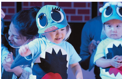
Everyone's favorite, the Baby Shark dance!