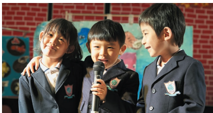
Speeches by children graduating this spring

Located in the beautiful surrounds of Yebisu Garden Place, Poppins Active Learning International School offers various activities for pre-school children aged 11 months and older. Under the new format, in November PALIS held its year-end performances with each class appearing separately. The children were very excited by their surroundings, outfitted like a real event venue with full-scale stage lighting and blackout curtains. Even amid the pandemic, we are working hard to plan events that show the children's growth and which they can enjoy in safety and comfort. PALIS also offers many programs open to outside participants, including a Saturday school and seasonal programs. We look forward to seeing you.