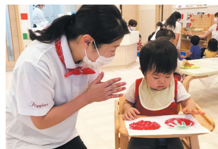
Activities for 'Tomato Day'

Since 2019, Poppins has been entrusted by Kagome to run its Vege Kids Nursery School – Where Kids Love Vegetables, which offers daily opportunities to explore vegetables through unique initiatives. Drawing on our experience with Vege Kids and food education activities, last year we collaborated with Kagome to run food education events at all Poppins nurseries for Vegetable Day (31 August) and Tomato Day (10 October). The children familiarized themselves with vegetables through a variety of activities, including a hands-on harvest and tomato scooping. This year, another vegetable-themed food education event is also planned for 31 January, as we continue working to deliver a broad range of high-quality experiences.