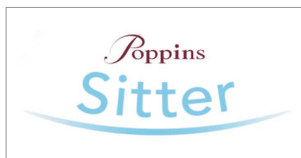
New Poppins Sitter logo