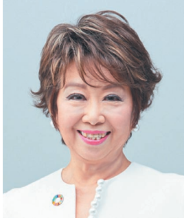
Chairperson, Representative Director Poppins Holdings Inc.