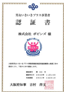
Osaka Prefecture Danjo Ikiiki Plus Business commendation

The Poppins Osaka branch has been designated a Danjo Ikiiki Plus Business! Osaka Prefecture's Danjo Ikiiki Genki Sengen register recognizes companies and organizations that make efforts to promote gender equality. Our Osaka branch received the Danjo Ikiiki Plus Business commendation, which was awarded to companies that achieved excellent standards in the past year across multiple judging criteria, including the number of female employees and the rate of parental leave use. At Poppins, we will keep striving to create better work environments for all employees, regardless of gender, and to help women realize their ambitions.