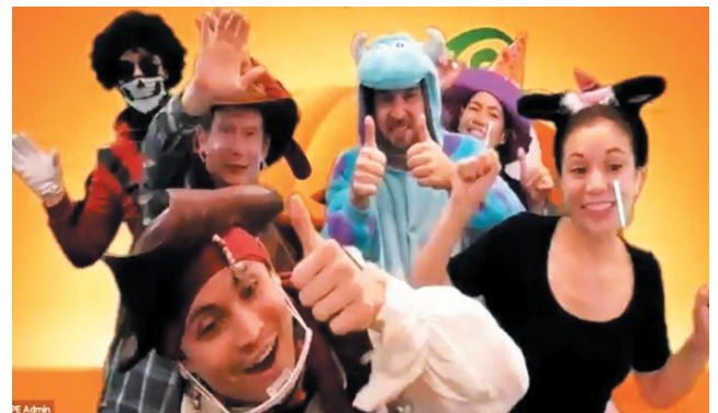
Halloween lessons by bilingual teachers