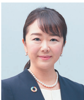
President, Representative Director Poppins Holdings Inc.