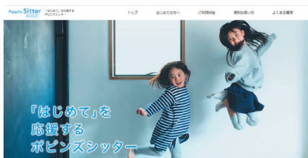
Our updated Poppins Sitter website!

our Poppins Nanny Services, Poppins Sitter will guarantee safety and peace of mind for more working women by remaining committed to service quality even as we boost efficiency and scale, helping to develop the child-rearing environments of as many families as possible.