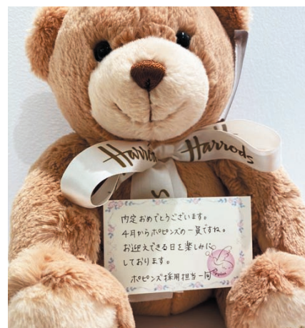
Message cards sent by our recruitment staff to all job offer recipients

Our 2021 New Graduate Job Offer Ceremony was held on 10 December. This year, some 130 recipients attended remotely from their respective homes. As Poppins strives to create a 'better normal' despite the pandemic, we spoke to the graduates about our cherished philosophy and the importance of self-improvement. We hope these messages will remain in their hearts as they get set to shine within our company. Listening to the president speak about this Poppins mindset, the recipients' faces were a picture of earnestness. They were also clearly looking forward to their new jobs in April, full of dreams and hopes. A representative speaking on behalf of the group expressed the graduates' firm commitment: "As we continue to grow, our passion for childcare will always stay with us". Our surprise gifts, sent to each home before the ceremony, also brought smiles to the graduates. The ceremony's warm atmosphere made us even more eager for the day when we can welcome those 130 fresh faces in person. From here, the job offer recipients will take part in various training programs on their way to becoming fully fledged professionals.